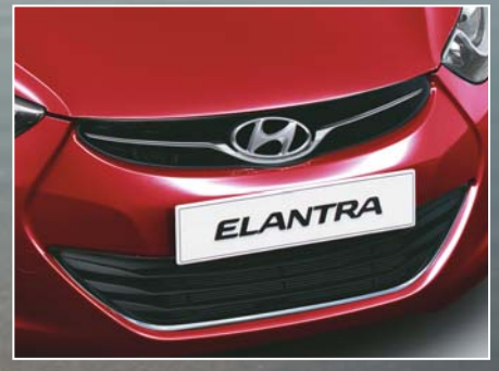
Front Grille Inspired by the fluidic design philosophy, the hexagonal family grille with chrome inserts gives the Neo Fluidic Elantra an elegant look that amplifies its appeal. Styled to perfection, the sweptback headlamps lend the Elantra an aggressive yet elegant look.

Our fluidic design philosophy has helped create this wind-crafted phenomenon that is sure to enchant all your senses. Right from the front grille to the tail lamps, the Elantra is a work of art that's sure to catch the eye of even the most discerning automobile enthusiast. Even the side character lines of the Elantra display top-class styling and innovation.