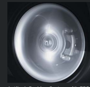
Antilock Braking System with EBD