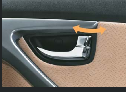
Impact Sensing Auto Door Unlock