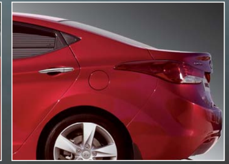
Sporty Trunk Lid The enhanced sporty trunk lid of the Elantra increases its aerodynamic efficiency and lends it a coupe-like appearance.