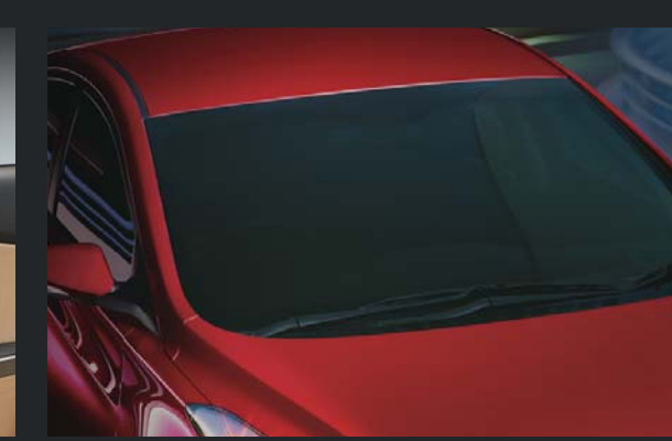
Solar Glass The Solar Glass protects the occupants against harmful UV rays while also insulating the cabin interior for enhanced AC performance.