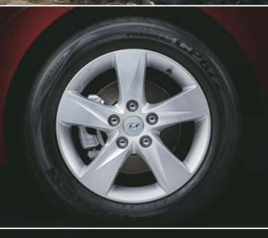
16" Alloy Wheels The Elantra comes with eye-catching 5 spoke 16" alloy wheels that lend your personality a sporty look.