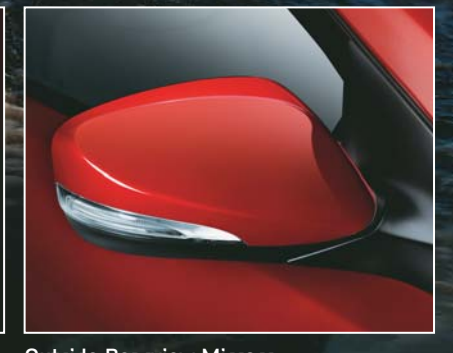
Outside Rearview Mirrors Aerodynamically sculpted rearview mirrors, that come with side repeaters, fold automatically and give the Elantra that aesthetic touch of perfection.