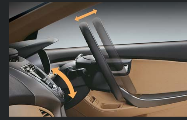
Tilt and Telescopic Steering This function allows you to adjust the steering in four different directions, thus helping you find the perfect driving position.

Electrically Heated Outside Mirror The outside rearview mirrors are heated electrically to help maintain visibility in extreme weather conditions.