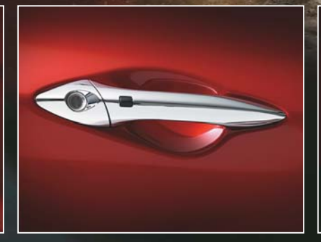
Chrome Door Handles With contemporary styling, the fog lamps in the Elantra give you perfect visibility just when you need it. The chrome door handles in the Elantra enhance the car's personality.