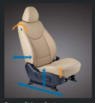
Power Driver Seat The power adjustable 10-way driver's seat allows you to mould the seat to your unique driving style, making it a pleasurable experience.

Rear AC Vents The Rear AC Vents provide perfect cooling and heating at the back of the car during extreme temperatures.