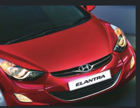
Automatic Headlight Control The automatic headlight control enhances convenience and In the case of an impact the doors of the Elantra open automatically switching on the headlamps as per outside visibility conditions.